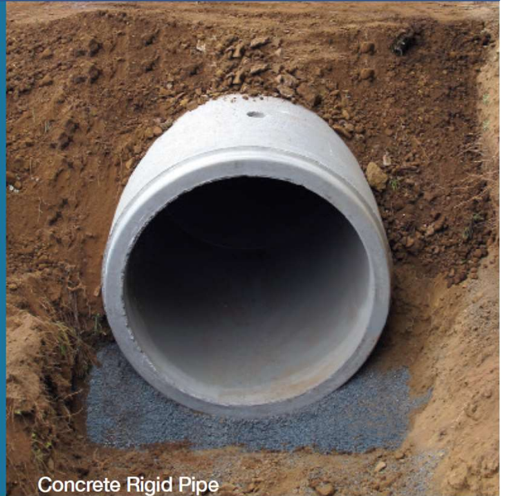
Concrete Rigid Pipe

For further details visit www.cpaaustralia.com.au